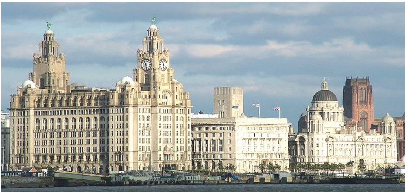
Liverpool Pier Head, with the Royal Liver Building, Cunard Building and Port of Liverpool Building